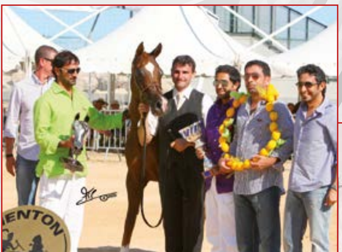
Kwestura (Monogramm – Kwesta/Pesennik)