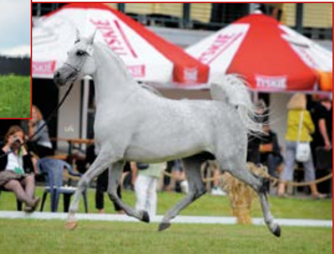
Etnologia (Gazal Al Shaqab – Etalanta/Europejczyk)