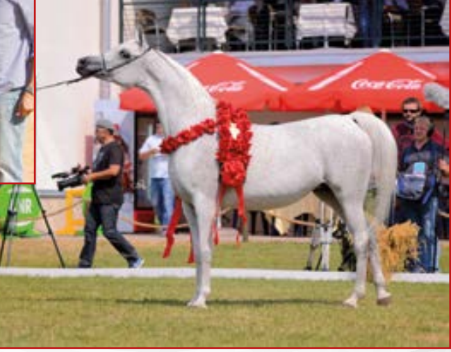
(Gazal Al Shaqab – Nina/Monogramm)