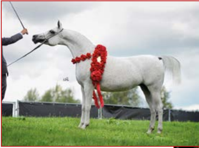
Pepita (Ekstern - Pepesza/Eukaliptus)