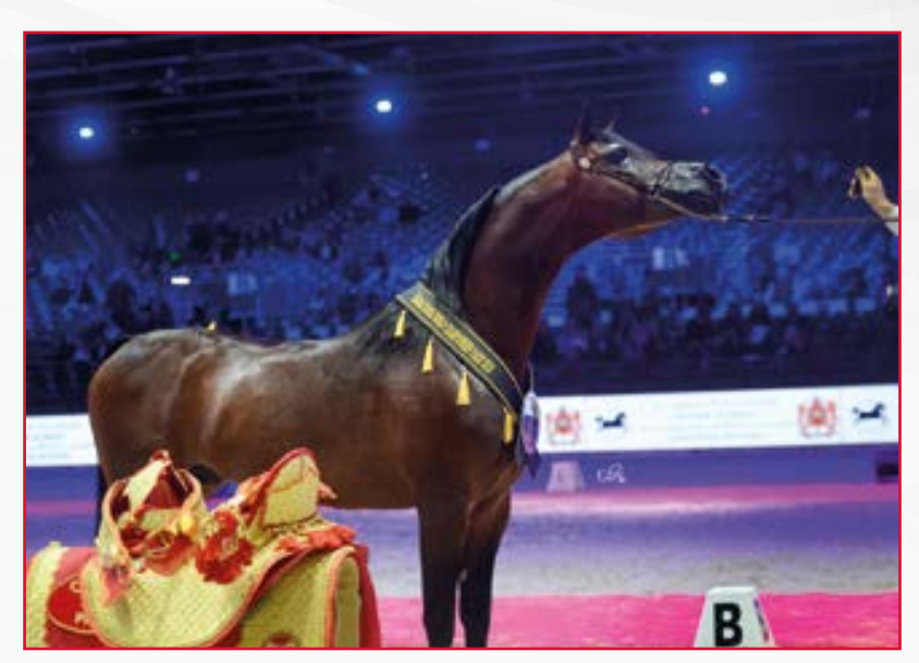
Equator (QR Marc – Ekliptyka/Ekstern)

Clients that made their purchases in 2015 made good investments. ADYGA (Kahil Al Shaqab – Amiga/Piaff, 130 thousand